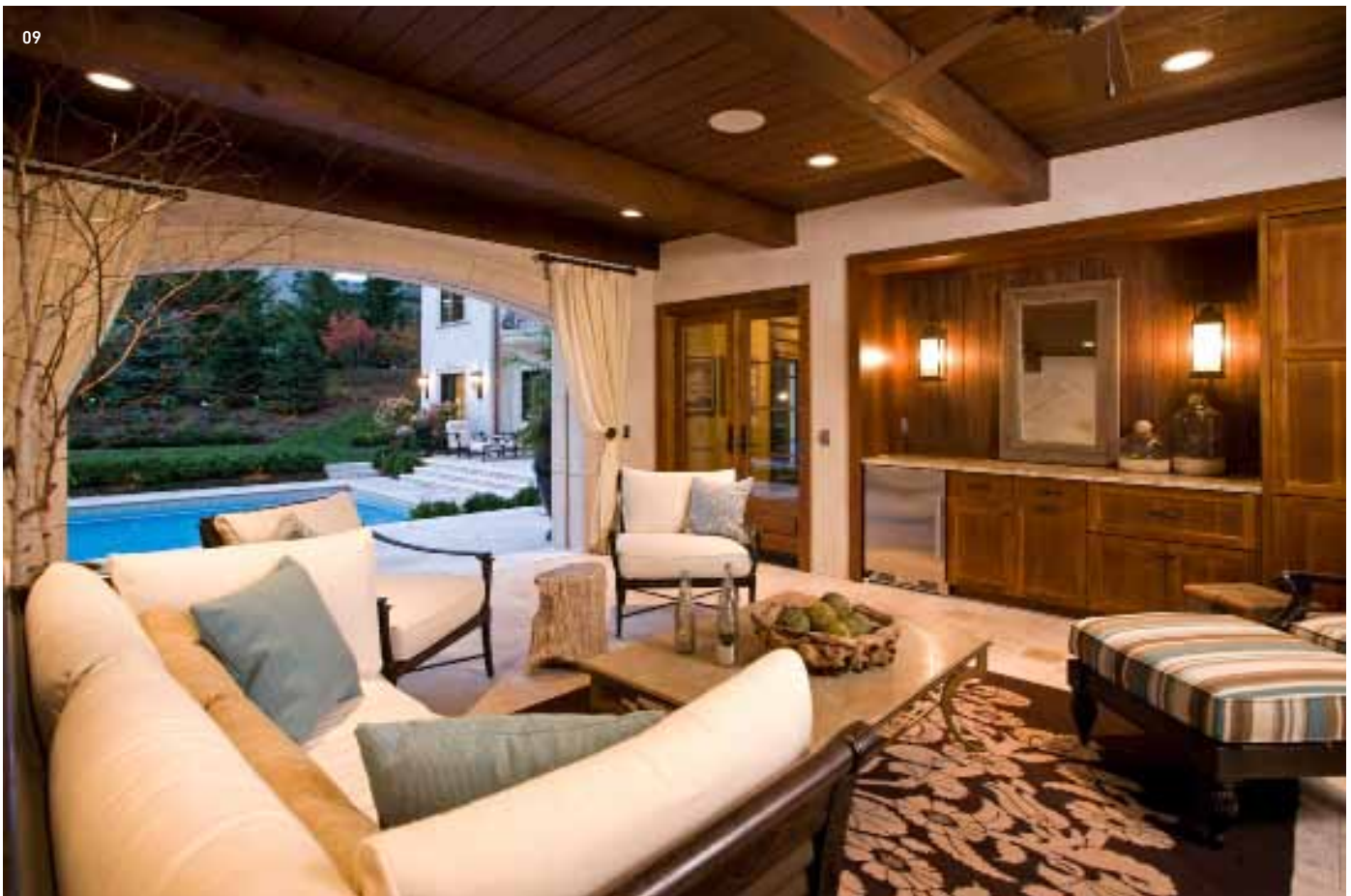
07 / In the backyard, relax in the limestone-lined concrete pool and hot tub. Both the cabana and terrace feature fireplaces. 08 / The kitchen and breakfast room have inset custom-made Black Walnut cabinetry, an Italian plaster ceiling, a handmade durango limestone hood, Black Walnut flooring and a coffered ceiling. 09 / The cabana is beneath the terrace and overlooks the pool, featuring a fireplace, bar, cedar ceiling and limestone flooring. The doors open into a pool changing area, bath and sauna.